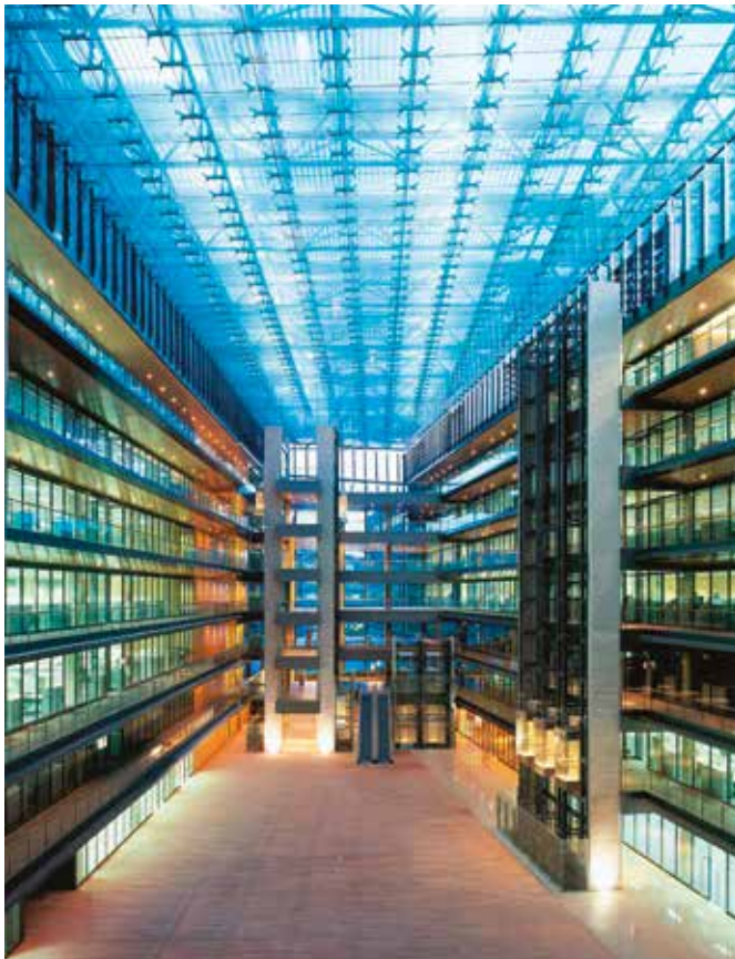
Spanish energy giant, Endesa, fills its Madrid headquarters atrium with daylight using an energy-efficient, ventilated glass roof made with SentryGlas®.

Experienced glass laminators, framing and facade system specialists and glazing contractors are available worldwide to meet the needs of architects and system designers specifying SentryGlas®.