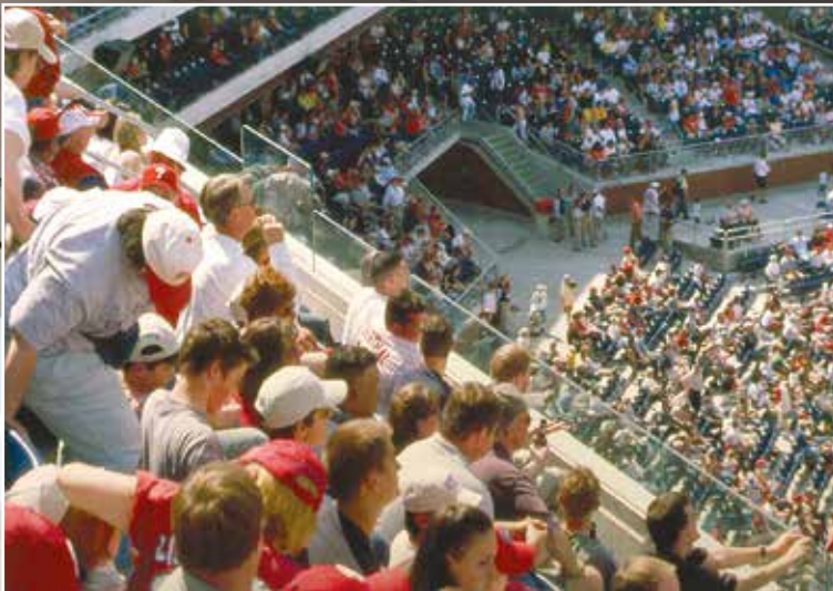
The strength and open-edge durability of SentryGlas® interlayer enable frameless safety glass balustrades at sports stadiums

Originally created for specialty markets such as high-security glazing and hurricane windows, SentryGlas® ionoplast interlayers now are being specified wherever architects or engineers need a material that can make a difference in glass performance.